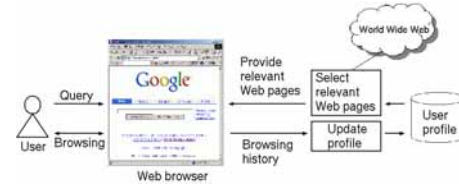
Figure 1. Overview of our system.